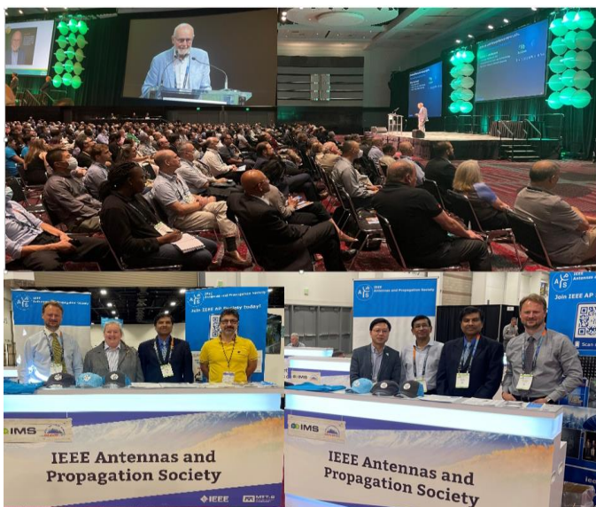
Fig 3: Photo of the IEEE MTT-S IMS (International Microwave Symposium) award event and AP-S Booth, venue is Denver Convention Centre, Colorado, June 20-23, 2022.