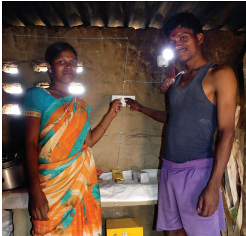
Brick Kiln customers enjoying electricity from a portable battery kit.

The center's computer lab supports digital literacy and, as an Internet café, helps support SES. United for Hope has been recognized by the UN for its work in bringing digital services to rural communities. Revenue is