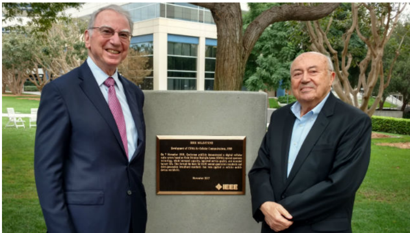
Irwin Jacobs (left) and Andrew Viterbi with the new IEEE Milestone plaque.

Twenty-eight years ago to the day when Qualcomm's CDMA wireless technology was first demonstrated, the San Diego company and its founders received a milestone award from the nation's top electronics association.