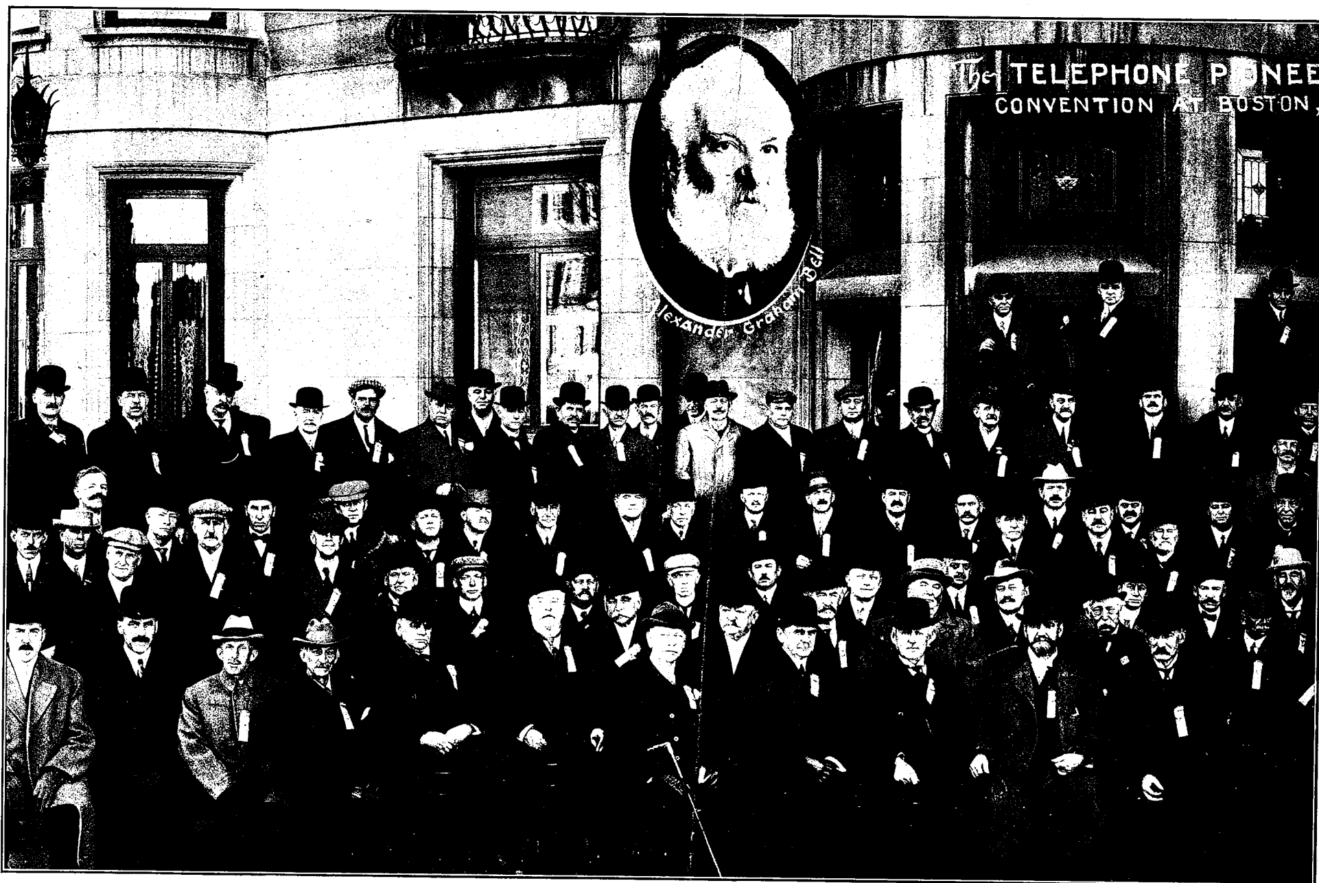
LEFT HALF OF GROUP, TELEPHONE PIONEERS OF AMERICA.