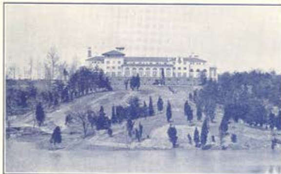
Congressional Country Club