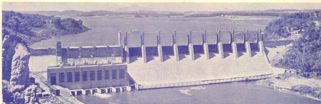
Claytor Dam of the Appalachian Electric Power Company