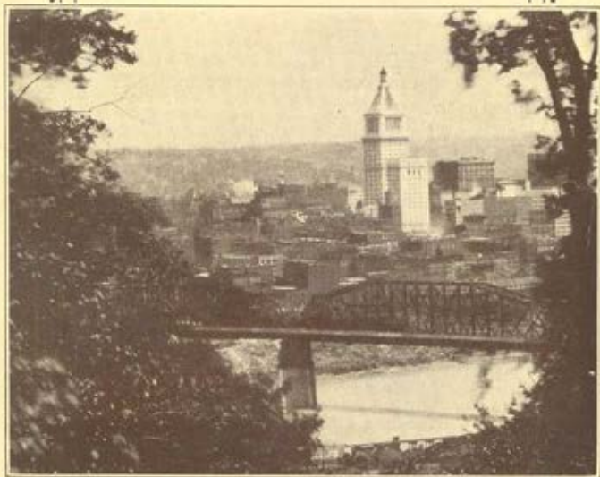
VIEW OF CINCINNATI