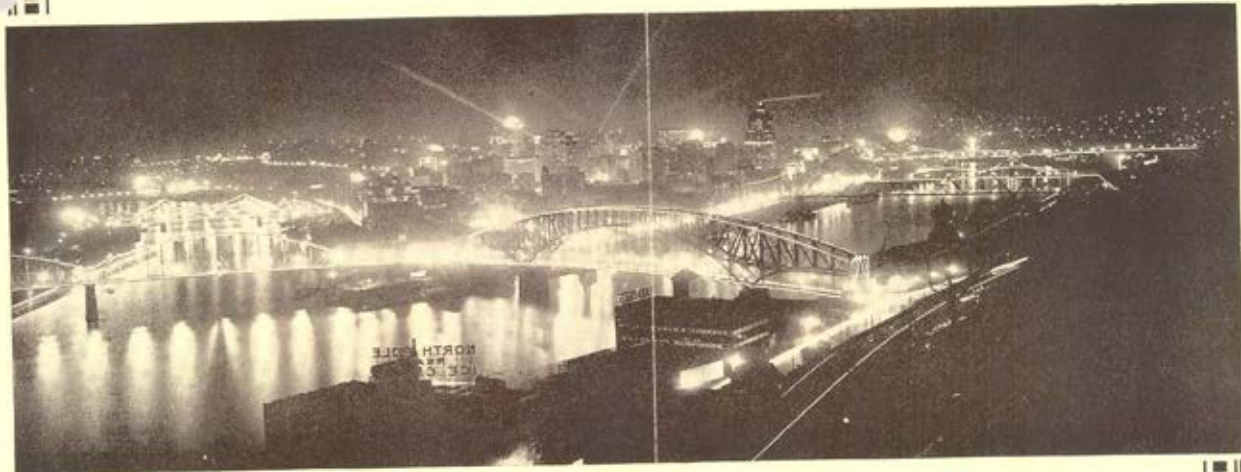
Pittsburgh, the "City of Bridges"