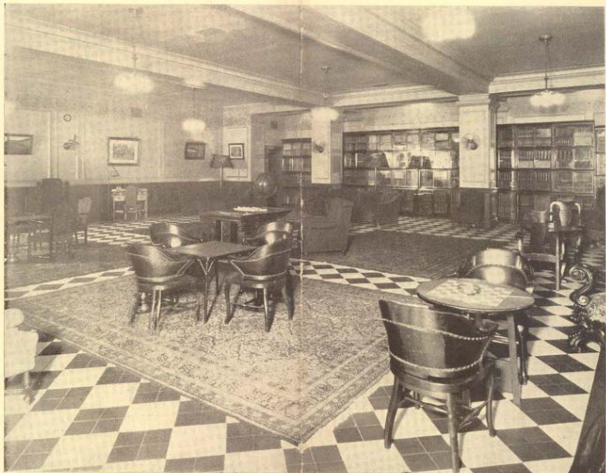
Club Room of the Engineers' Society of Western Pennsylvania