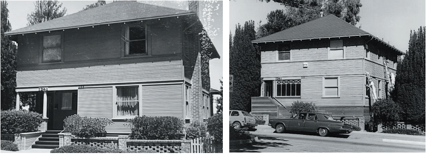
The DRI Engineering building before and after the “raise.” The unpainted boards at right show the raised area.

in the basement for a new Digital Equipment Corporation VAX 11/750 computer system. After several weeks, supported by heavy wooden beams and house jacks, the engineers' desks were five feet higher.