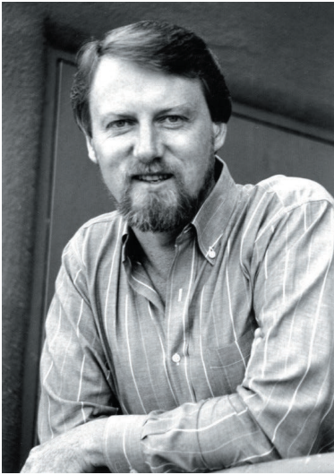
Gary Kildall in 1988.

By successfully booting a computer from a floppy disk drive, they had given birth to an operating system that, together with the microprocessor and the disk drive, would provide one of the three fundamental building blocks of the personal computer revolution. While they knew it was important, neither realized the extraordinary impact it would have on their lives and times.