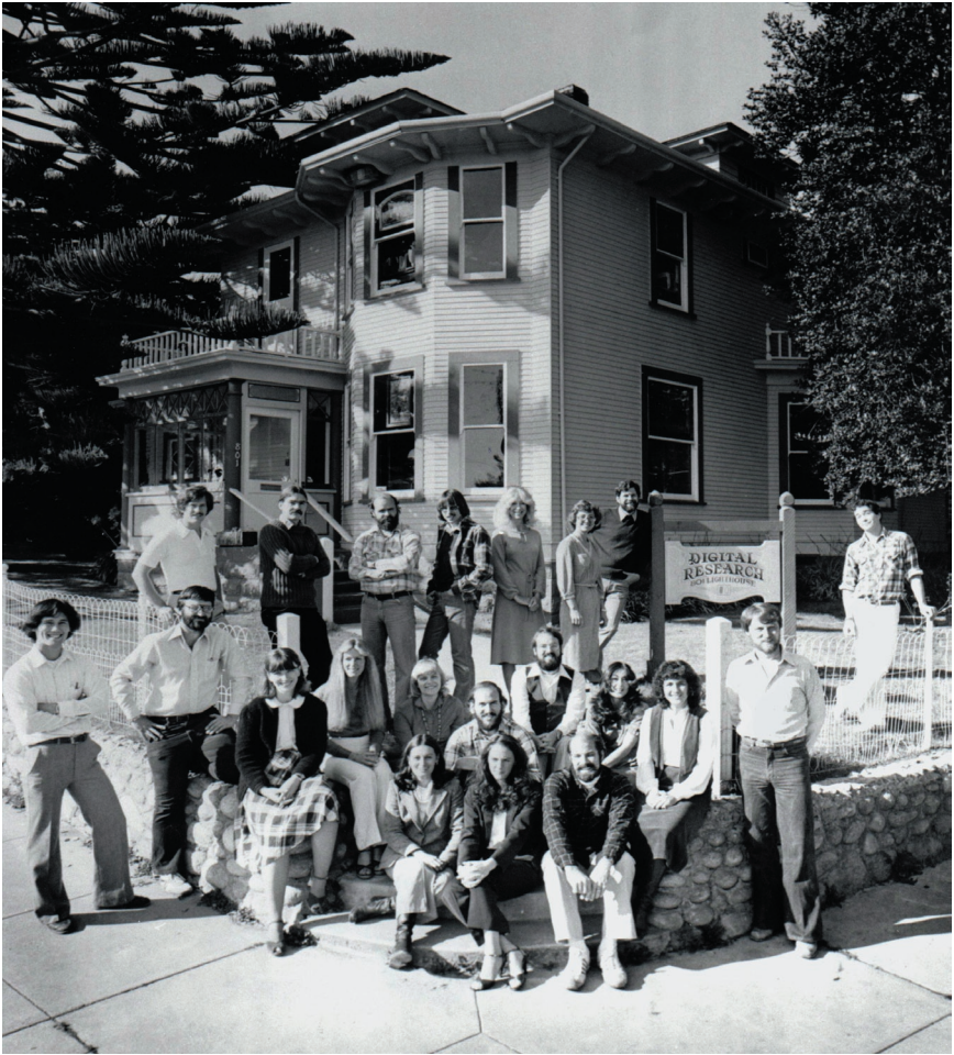
DRI staff outside 801 Lighthouse Avenue, Pacific Grove in November 1980.

A licensing deal with IMSAI bestowed credibility across the industry. CP/M became accepted as a standard and was offered by most early personal computer manufacturers, including pioneers Altair, Amstrad, Kaypro, and Osborne.