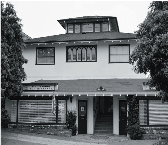
716 Lighthouse Ave. The upper floor is now a private residence.

The BIOS code allowed all Intel and compatible microprocessor-based computers from other manufacturers to run CP/M on any new hardware. This capability stimulated the rise of an independent software industry by expanding the market’s potential size for each product. A single program could run without modification on computers from multiple manufacturers, laying an essential foundation for the personal computer revolution.