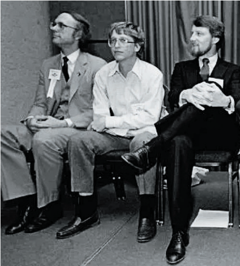
With Bill Gates at a technology conference.