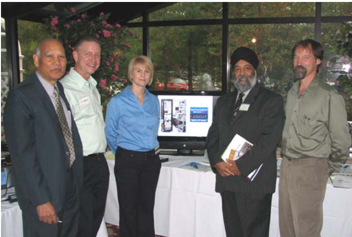
Custom Calibration Inc. Exhibit