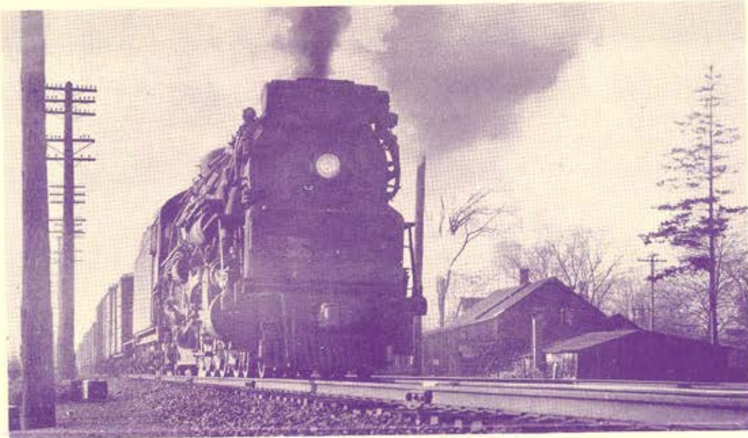
Fast Dependable Freight Service Plays an Important Part in the Present Emergency