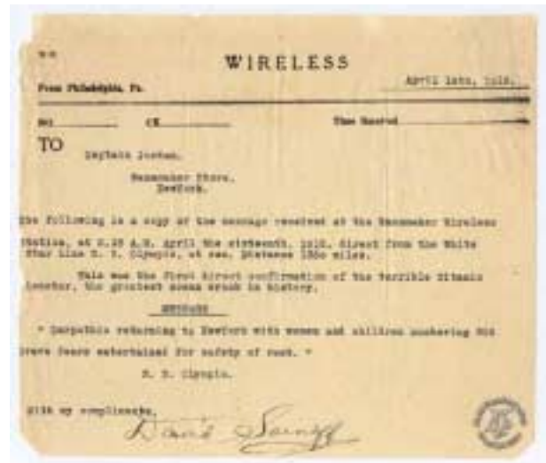
David Sarnoff's telegram to "Captain Jordan" giving total number of survivors from Titanic, April 16, 1912.

In the wake of the Titanic, American Marconi expanded its business by a factor of twenty over the next two years. This occurred partly from legislation mandating continuous staffing of shipboard radio stations and partly from the