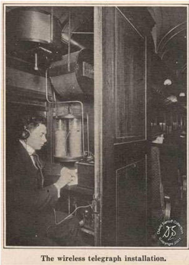
David Sarnoff in radio cabin on board Lackawanna Railroad passenger car, November 1913.

First was that of radio communications with railroads. In November 1913, Sarnoff worked with the Lackawanna Railroad's telegraph superintendent to design, install, and demonstrate a mobile system between the stations at Binghamton, New York, and Scranton, Pennsylvania. 9 This led to major demonstration in January 1914, and Marconi obtained contracts for five stations on the line over the next nine months. 10 While it appears that few other railroads joined in adoption of the technology, Sarnoff continued to campaign on its behalf until 1927, through annual appearances at the meetings of the railway telegraph superintendents and the American Railway Association. 11