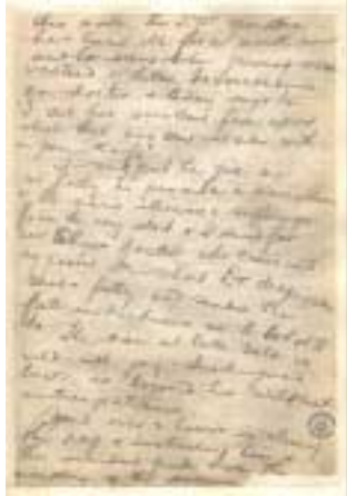
Page from David Sarnoff's diary on board the Job Brothers' seal-hunting ship, the Beothic, in which he describes his relaying the dialogue between the ship doctor and the radio operator at Belle Isle, Labrador, March 26, 1911.

A year later, Sarnoff was manager of the Marconi station atop the Wanamaker's department store at Broadway and Eighth Street. Sarnoff exaggerated his role in the aftermath of Titanic's sinking, but he was involved, first in working with two other operators at the Wanamaker station to obtain the number of survivors and then in trying to get their names from the Marconi Seagate station before the Carpathia arrived with the survivors in New York City. 8