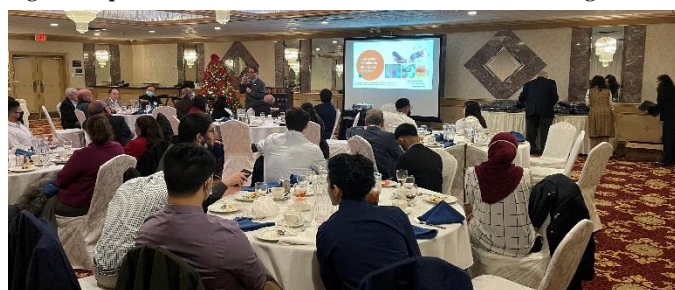
Figure 9: Section's End-of-the-year Dinner Meeting Event

Figs.11-15 show the NJ ExCom members enjoying dinner at the Nov. 30 th Dinner Meeting Event. We know that the current year has been hard on many of you. This was a chance to get together in person to make networks, galvanize, participate in opportunities, and move your career forward. For those who could not join on Nov 30 th event in-person, will catch-up with them next year.