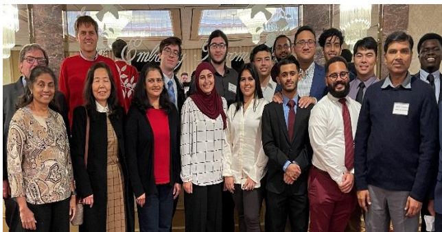
Figure 10: NJIT Student Branch Chapter and NJ ExCom members at the Nov. 30 th Dinner Meeting Event