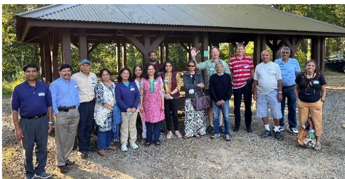
Fig. 1: Members of the IEEE North Jersey Section at the Outdoor Event

As the COVID-19 vaccine became available and treatment options became more evolved, the restrictions on travel and gatherings and holding in-person events were becoming minimum and our North Jersey Section and its Membership Development, Students, YP, WiE and all Chapters, after several months of virtual meetings and events, gathered together at the Lewis Morris Park, in Morristown, New Jersey, on Sunday, September 26 th 2021.