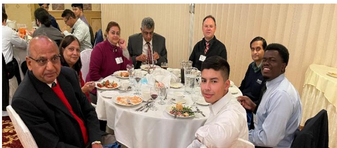
Figure 14: NJ ExCom members at the Nov. 30 th Dinner Meeting Event