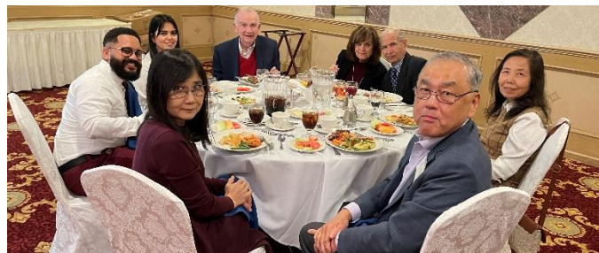
Figure 15: NJ ExCom members at the Nov. 30 th Dinner Meeting Event

Our section has successfully held a total number of 157 events , as per vTools entries.