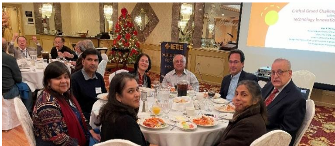
Figure 11: NJ ExCom members at the Nov. 30 th Dinner Meeting Event