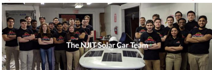
Fig17: Photo of NJIT Solar Car team ( https://solarcar.njit.edu/ )

We look forward to the year 2022 with a hope to return to normalcy, with more in-person meetings, though organizers may opt for hybrid options going forward.