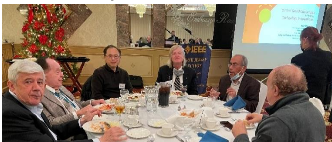
Figure 13: NJ ExCom members at the Nov. 30 th Dinner Meeting Event