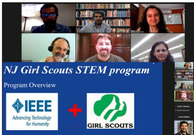
Figure 16: Screenshot of NJ section and AP-S COPE Zoom meeting