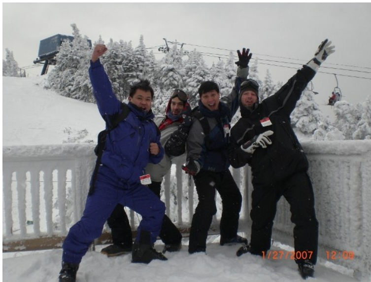
GOLD members having fun at the peak of the Cannon Mountain.

us, the pristine snow, the snow covered trees.... the view was just magnificent! We captured the view by taking some pictures of course.