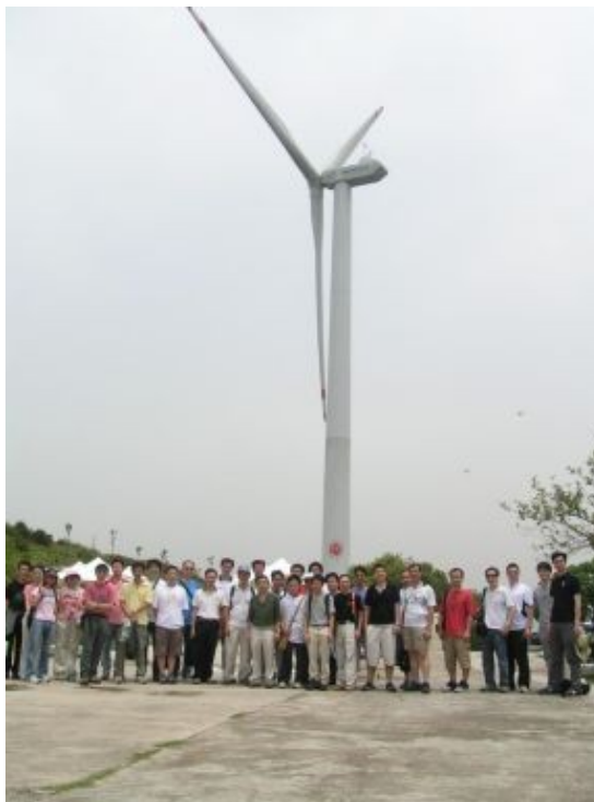
Hong Kong GOLD members at the Lamma Winds.

All in all, the trip was a resounding success as it was very popular among GOLD members. It proved to be an excellent opportunity to learn about renewable energy and for GOLD members to network with each other.