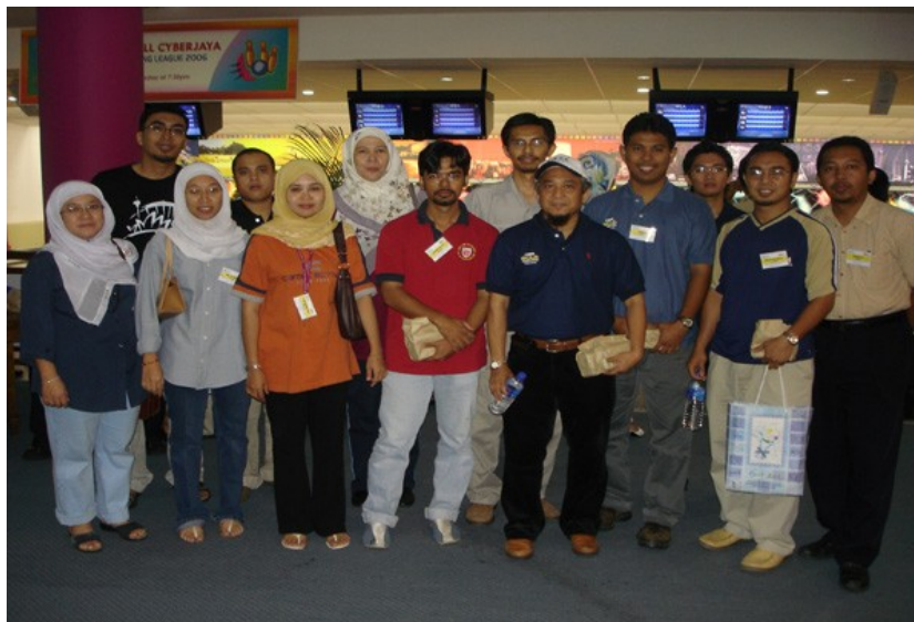
A group photo of the members before they unleash their superb bowling skills.

Another GOLD activity for 2006 was the Inter-society Bowling Tournament. The event took place at Putrajaya, the administrative capital of Malaysia on 29 th July 2006. Eight teams, representing various IEEE Societies and Chapters, participated in the tournament. The main objective of this event was to encourage interaction between the senior and young members. Every participant was given a free and exclusive GOLD Malaysia polo t-shirt sponsored by a company. The companies had the opportunity to promote their profiles and services in the program booklets. Some members turned up fully equipped, before unleashing performances that any professional would be proud of! It was also very encouraging for us to see senior members, several in their fifties, taking part in the event and sharing laughter and joy with twenty-something year old members!