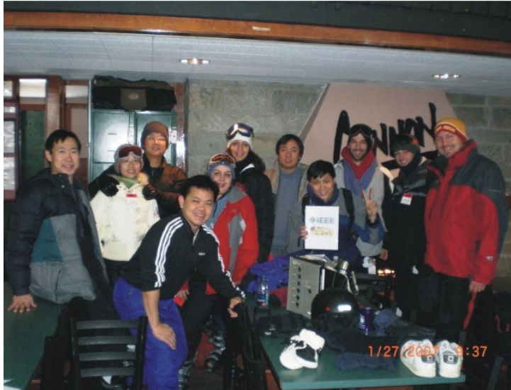
Boston GOLD members get ready to hit the slope.

To all ski enthusiasts, snow can only mean one thing – the chance to have some good, clean fun! On January 27th, that was exactly what a small group of us did. Instead of snuggling under toasty warm duvets in bed, we braved the -10F cold and met up at McDonald's in Tilton, NH at 7.30am. From there, we drove up Cannon Mountain at Franconia Notch, settled down and set up a nice big IEEE sign on a table. I was able to pick up some special discounted tickets and so handed them out to all present. Along with the tickets, we also distributed walkie-talkies, which kept everyone in constant communication. In the meantime, a few members and guests in the group went on to the ski school to learn how to ski.