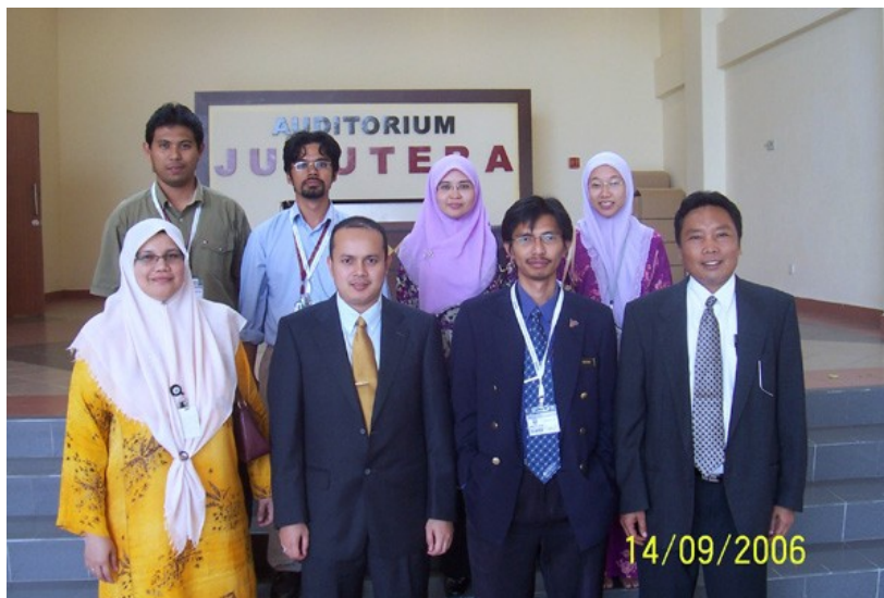
GOLD organizing committee and the National Bank Officers.

Another GOLD activity for 2006 was the Inter-society Bowling Tournament. The event took place at Putrajaya, the administrative capital of Malaysia on 29 th July 2006. Eight teams, representing various IEEE Societies and Chapters, participated in the tournament. The main objective of this event was to encourage interaction between the senior and young members. Every participant was given a free and exclusive GOLD Malaysia polo t-shirt sponsored by a company. The companies had the opportunity to promote their profiles and services in the program booklets. Some members turned up fully equipped, before unleashing performances that any professional would be proud of! It was also very encouraging for us to see senior members, several in their fifties, taking part in the event and sharing laughter and joy with twenty-something year old members!