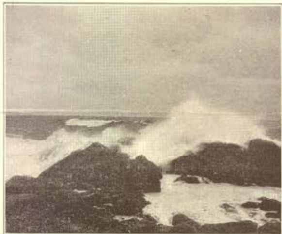
A Storm at Marblehead (near Swampscott)