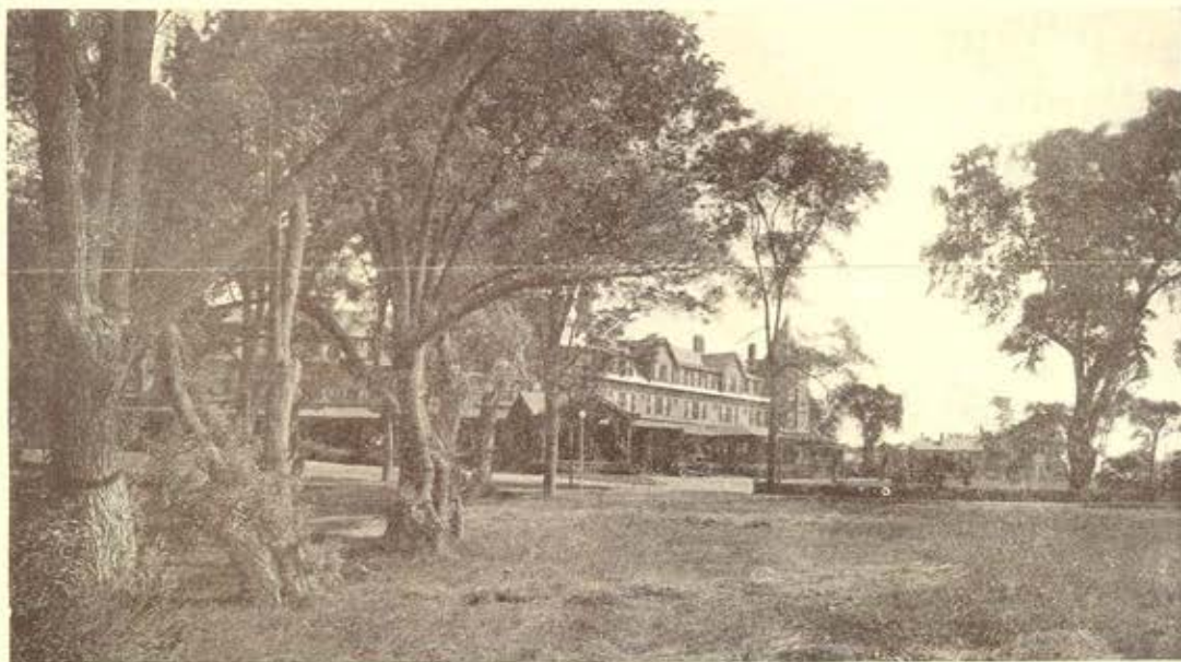
Hotel Farragut at Rye Beach

At Rye Beach, headquarters will be established at the beautiful Hotel Farragut where a very excellent buffet lunch will be served, consisting essentially of the numerous sea foods for which this section is famous. There will be opportunities for salt-water bathing, as the hotel is situated directly on the ocean front. There will be dancing and bridge for those so desiring, with numerous entertainment features, including field sports for which prizes will be distributed. Busses will conduct the party back to Swampscott in plenty of time for dinner and the evening entertainment at the Ocean House.