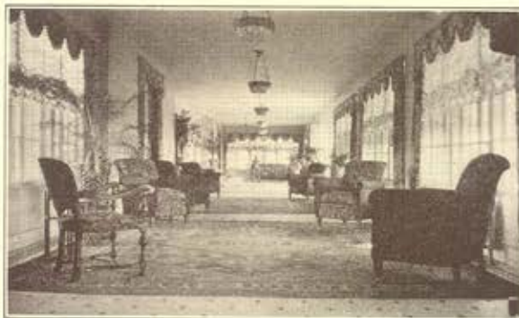
Interior of New Ocean House