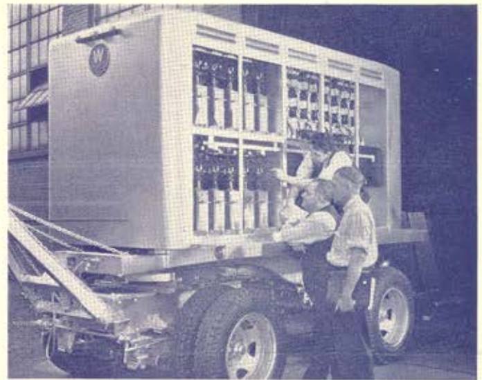
Portable Capacitor Units play an important part in emergency operation and their application will be discussed in the first session on Monday.