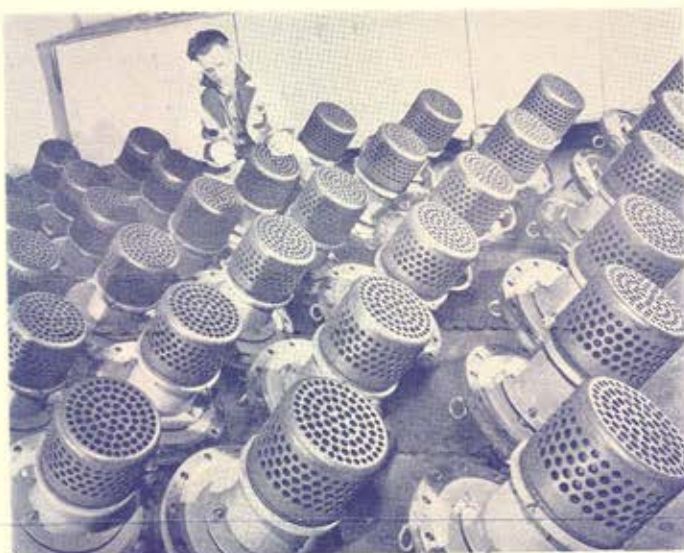
"The Ignitron"—one of the types of electronic tubes to be discussed in the Wednesday afternoon conference.