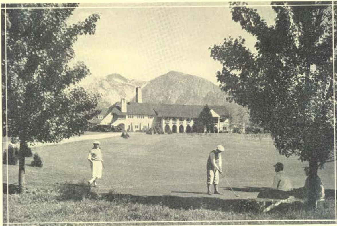
The Salt Lake Country Club