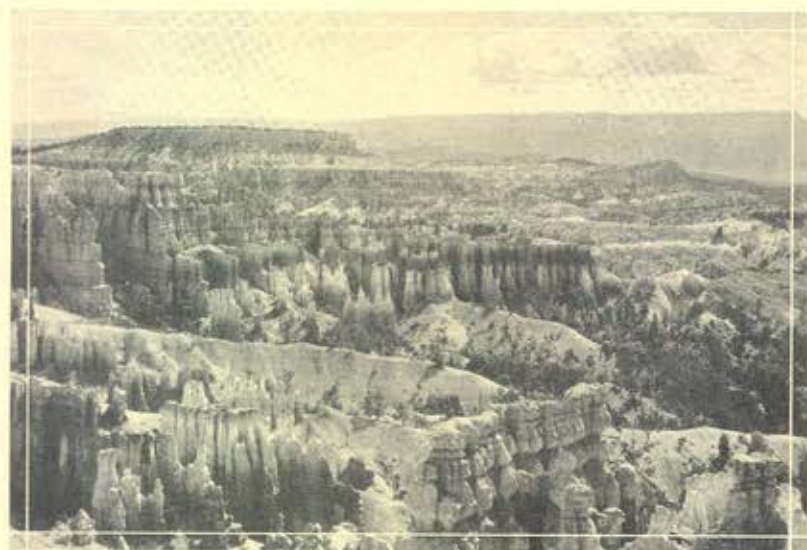
A Glimpse of the North Amphitheater in Bryce Canyon