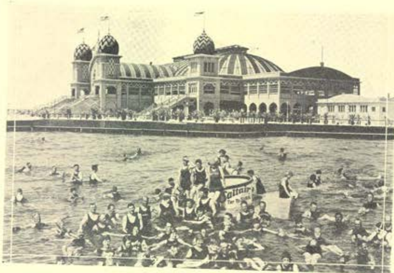
The World Famous Saltair

Outing at Saltair participated in by the entire convention group.