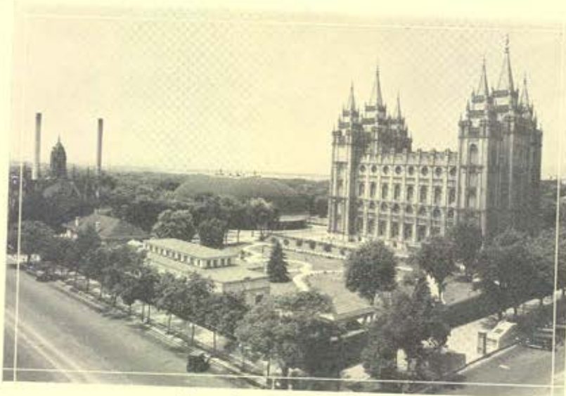
Mormon Temple and Tabernacle