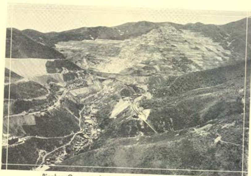
Bingham Canyon and Mine of the Utah Copper Company

Alternate inspection trips to local points of interest including mining and industrial developments will be arranged for those who desire it.