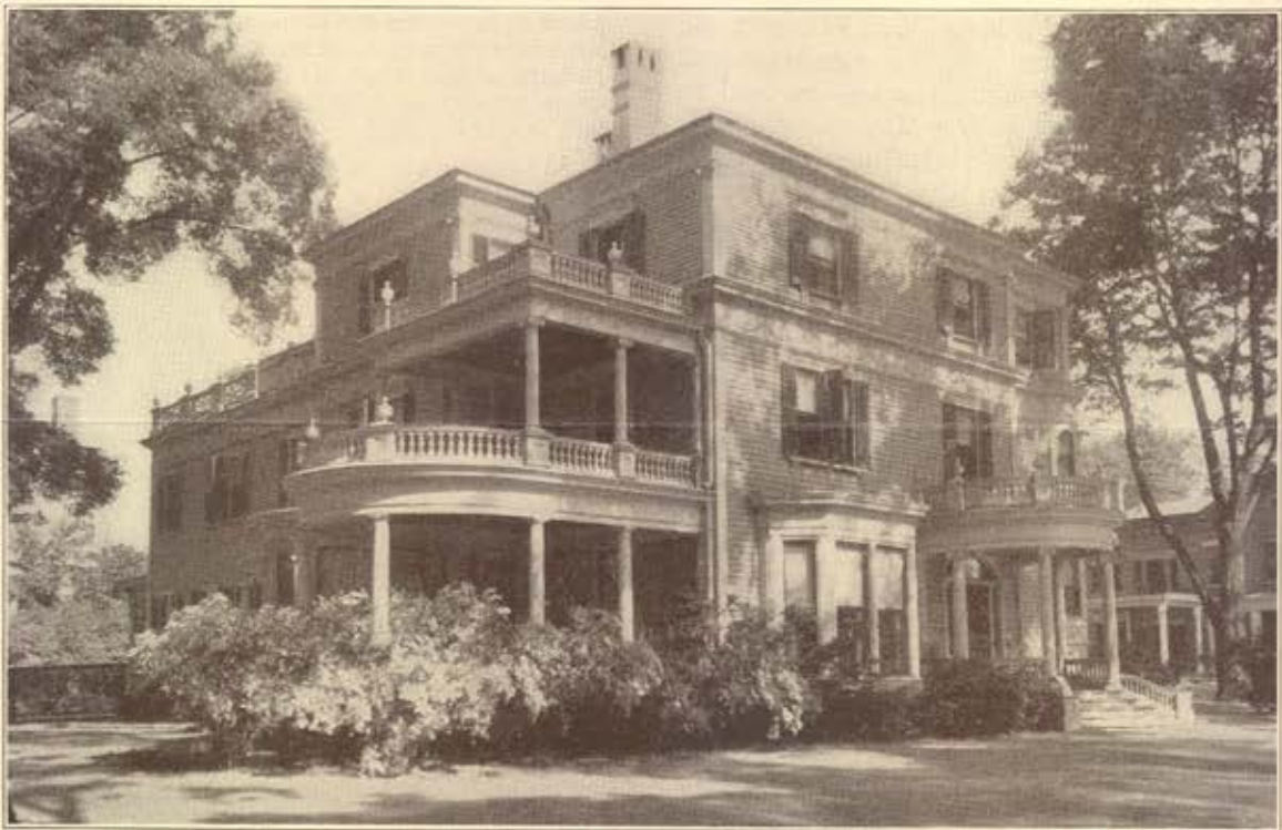
The Stanley Club where the Student Dance will be held on Friday Evening.

Headquarters: Curtis Hotel, Lenox, Massachusetts