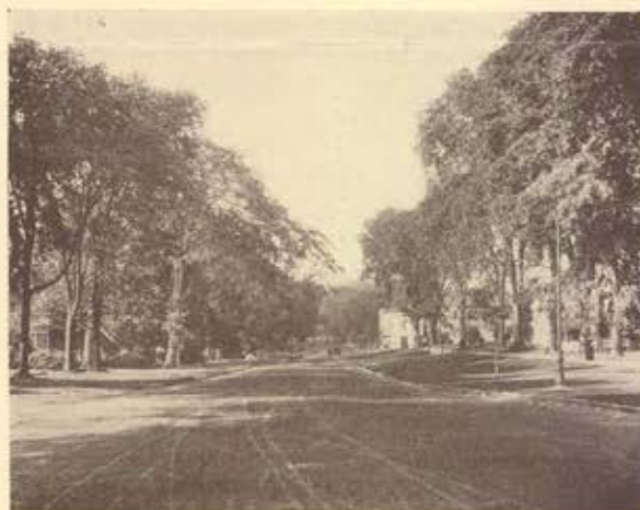
A typical New England village scene— Main Street, Lenox, Mass.