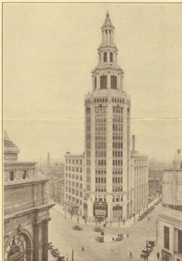
Electric Building at Buffalo

Luncheon at the Hotel Statler followed by a Fashion Show presented by one of Buffalo's smartest shops.