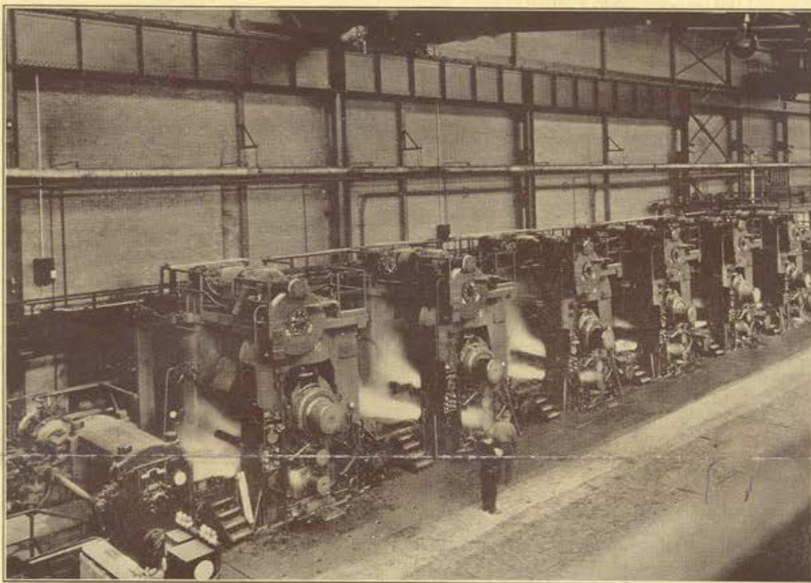
LACKAWANNA PLANT of the BETHLEHEM STEEL CO.—The finishing train of six rolling mills and a scale breaker in action with strip simultaneously engaged in all six