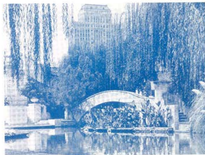
San Antonio River Scene

*DP.—District Paper; no advance copies are available; not intended for publication in TRANSACTIONS.