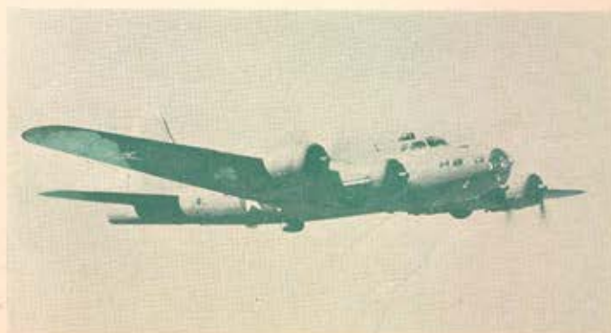
Aerial View of the B-17 Flying Fortress